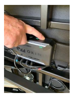
5. Pairing 6. Press Remote Control PAIR button until blue light is flashing Press Remote PAIR button twice