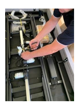
2. Cut zip ties