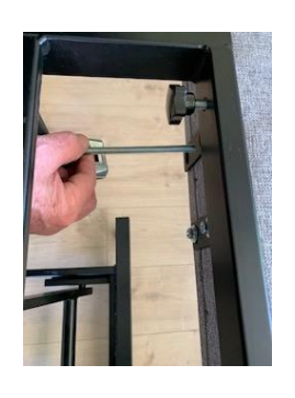
7. Connect Boards