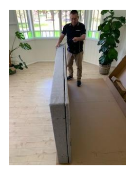
3. Lift bed on its side