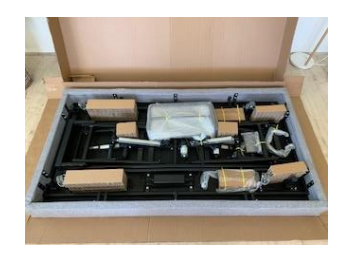
1. Lay box on the floor, open box & remove packaging