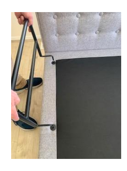
8. Connect Grab Rail